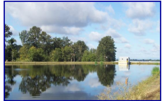
Pond at Kraemer's Nursery in Mt. Angel, Oregon where reused water is stored.

The Agpac Educational Services Association hosted the 2008 Natural Resources Tour on September 22. This year's fact-finding tour highlighted several innovative agricultural operations in the Willamette Valley. The tour included Kraemer's Nursery in Mt. Angel, an 800-acre wholesale nursery that uses cutting edge water conservation and reuse technologies; the Oregon Garden in Silverton, where the City of Silverton's treated effluent is reused to irrigate landscaping and supply wetlands; lunch at Taylor Farms, and an overview of grass seed farming management practices; East Valley Water District's potential water storage site in Silverton; and a tour and tasting of the Oregon Cherry Growers Cooperative in Salem.